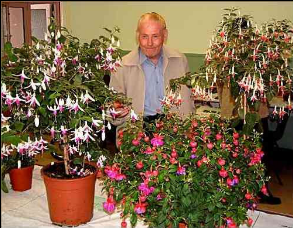
Some examples of the flowers of Caerwent... The one in the middle's called Dennis!