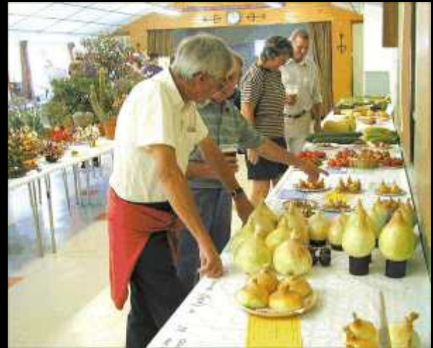
These folk 'know their onions' as the old saying goes (and their cabbages, and their flowers and their potatoes, and their tomatoes...)