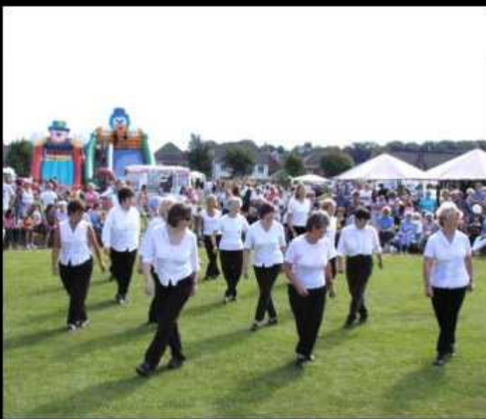
Among the many events taking place throughout the day in the Showring for the delight of the spectators was Caerwent's own team of line dancers.