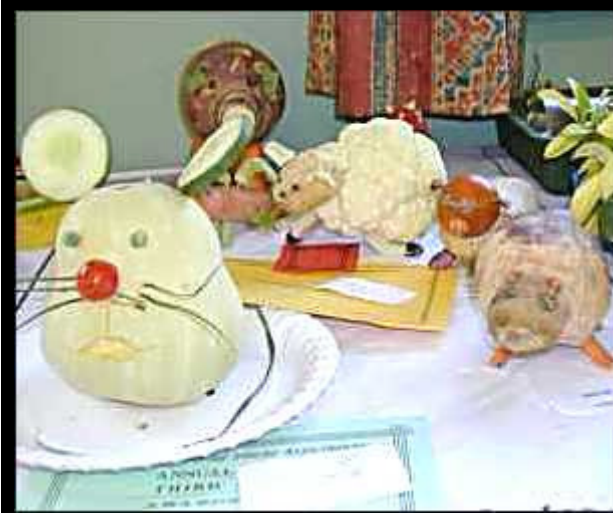
Of course it's not all serious: Here's the children's contest on the left, and on the right the, er, most unusual shaped vegetable ...