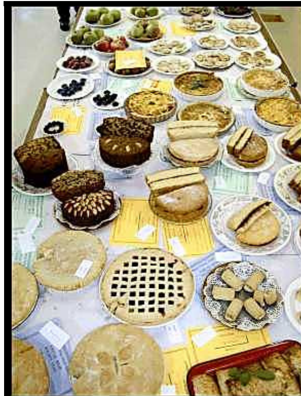
Aaah, calories! The judging table grans under ther weight of all those delicious looking entries in the various cookery categories.