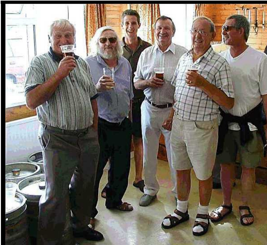
Some of the communities "Old Families" were at the show - here enjoying a get-together in the bar with some of the newer members of the community.