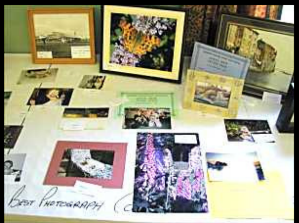
More exhibits to delight the eye... Best Miniature Garden in a Seed Tray on the left, and Best Photograph on the right.